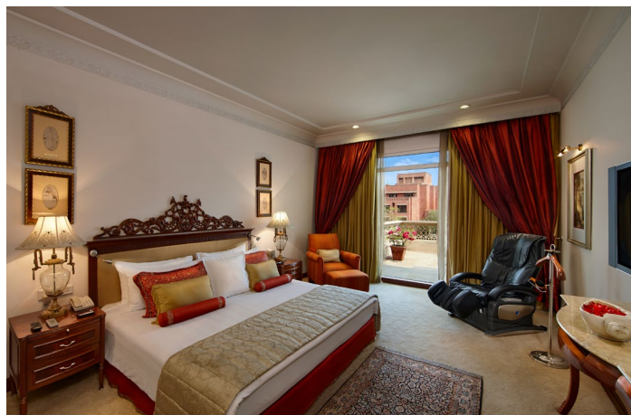
Presidential Suite – Bedroom, ITC Rajputana, Jaipur

Be transported to the courtly grandeur that express out the splendid and magnificent history of the Rajputana region, wrapped in complete luxury.