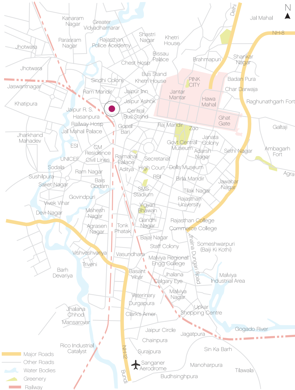
● ITC RAJPUTANA