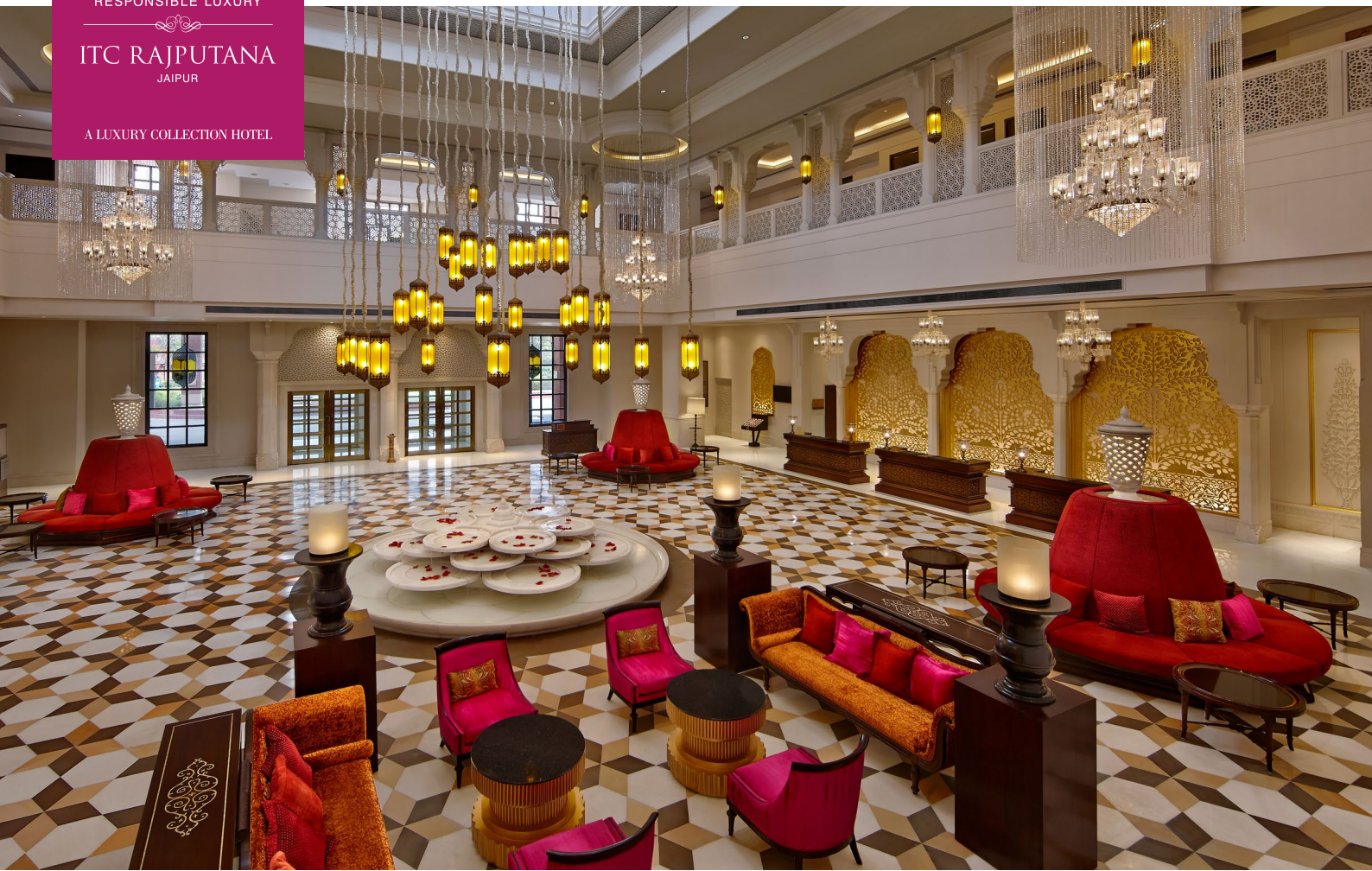
Jaigarh Lobby – ITC Rajputana, Jaipur