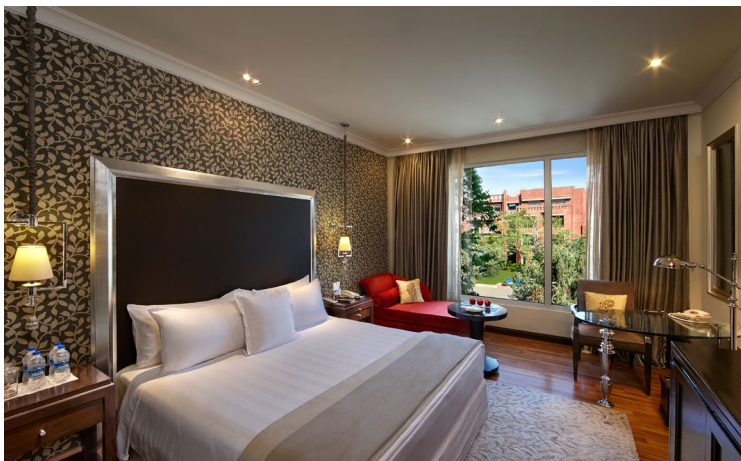
Rajputana Royale Room – ITC Rajputana, Jaipur