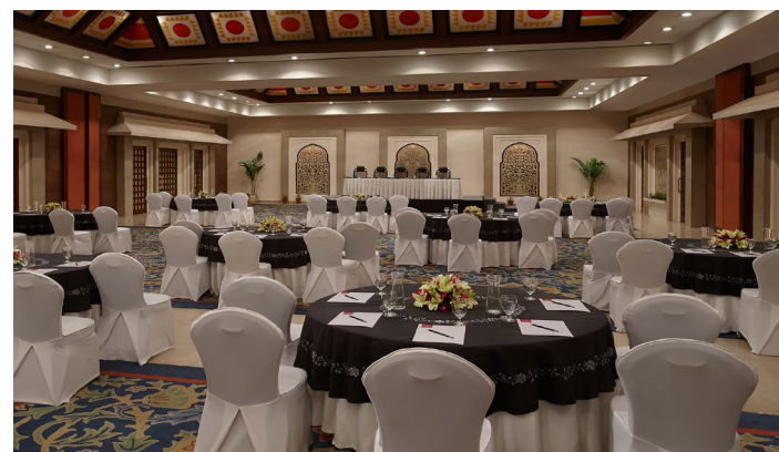
Suryavanshi Mahal – ITC Rajputana, Jaipur