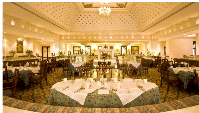
Jal Mahal – ITC Rajputana, Jaipur

Jal Mahal presents the irresistible temptation of contemporary cuisines. An extravagant choice of delicacies makes it one of the best restaurants in Jaipur.