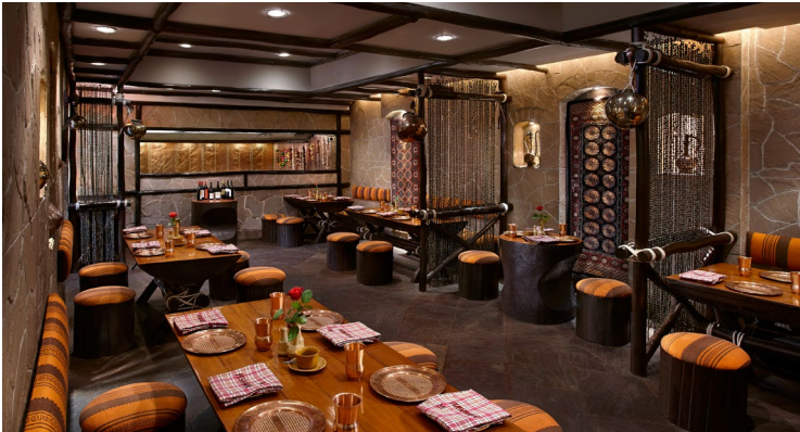
Peshawri – ITC Rajputana, Jaipur