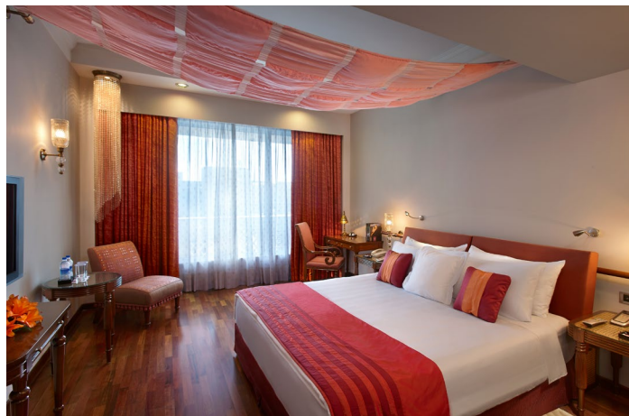
Thikana Suite – Bedroom, ITC Rajputana, Jaipur

These rooms offer a world where you can experience the finest in hospitality. The gracious elegance of the decor and warmth of personalised service makes your stay a truly memorable experience.