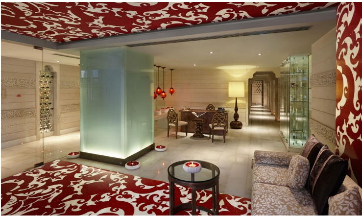
Kaya Kalp – The Spa, Reception, ITC Rajputana, Jaipur

Indulge in a wide and unique array of body and mind therapies from all over the world to rejuvenate the senses in style. Kaya Kalp – The Spa features five exclusive treatment rooms/suites providing European, Western, Oriental and Indian treatments, and traditional Spa therapy. Pamper your senses silly as you lose yourself in the luxurious yet tranquil ambience of Kaya Kalp.