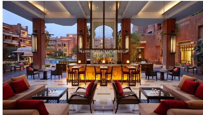
Jharokha Poolside Lounge – ITC Rajputana, Jaipur

Spend your evenings relaxing at our wooden deck lounge, with riveting views of the pool and instrumental folk music in the evening. Jharokha offers you your favourite drinks and snacks.